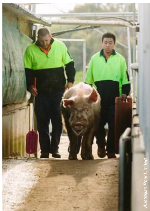
Australian Pork Limited

AUSVETPLAN (2020) 21 provides information for managing disposal of a large number of carcasses that may assist the development of a mass disposal plan.