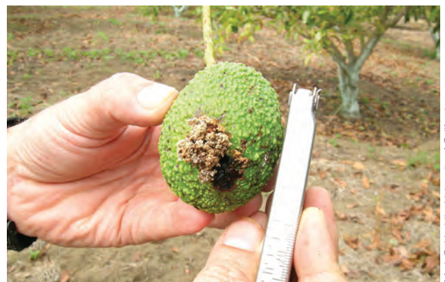
Frass accumulation around exit holes