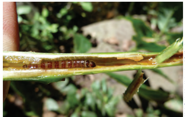
Larvae can bore into branches as well as fruit