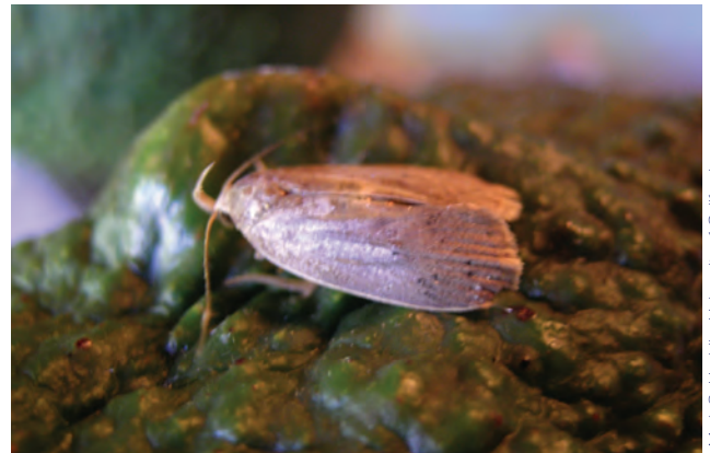
Adult moths are greyish brown in colour

The moths disperse locally through flight and fruit movement. Longer distance spread will most likely be from fruit movement.