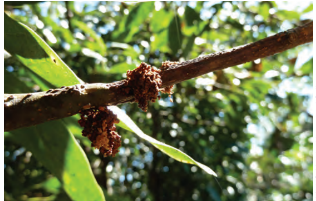
Frass accumulation can also be seen in infested branches