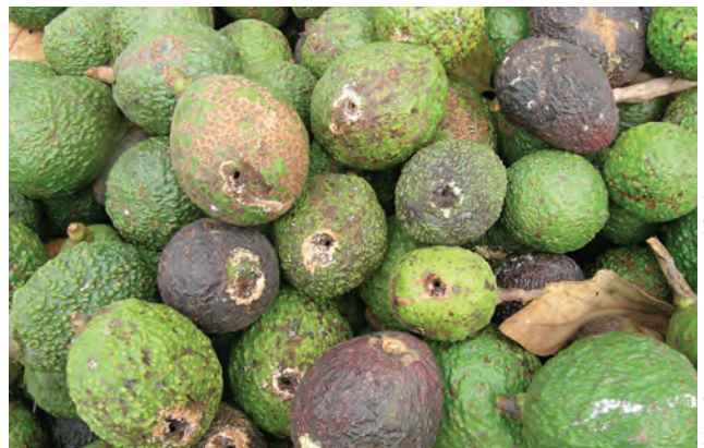
Exit holes in fruit are an obvious symptom of moth presence