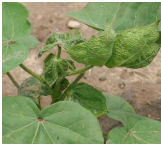
Figure 1. Upward cupping of leaf margins and thickening of leaf veins

Plants which are stunted and/or have deformed leaves, particularly with cupping, should be selected for closer evaluation. Holding suspect leaves up to the light can help in identifying disease symptoms of thickening and darkening of the leaf veins and the presence of abnormal growths emerging from leaf veins.