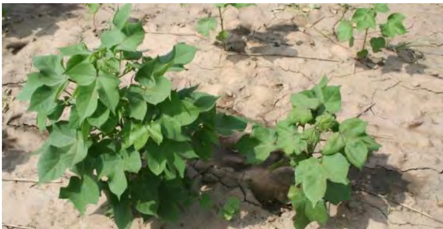
Figure 3. A CLCuD-affected plant on the right showing the typical stunting symptoms, growing next to a healthy plant