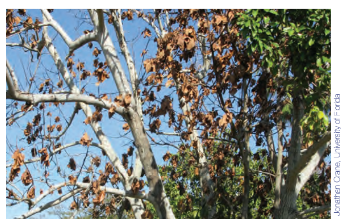
Development of laurel wilt on part of a tree