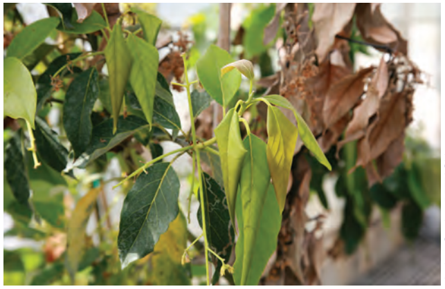
Early symptoms on avocado