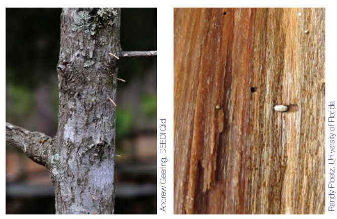
(Left) External damage from the beetle – note strings of ejected wood fibre (frass). (Right) Internal damage from Redbay ambrosia beetle – note bore holes