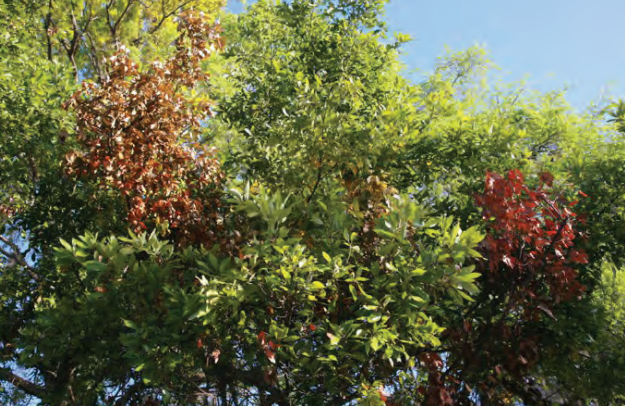
Defoliation of upper canopy and symptoms developing in lower portions of the tree

If you see anything unusual, call the Exotic Plant Pest Hotline