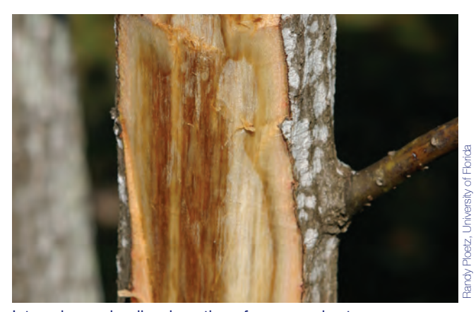
Internal vascular discolouration of an avocado stem