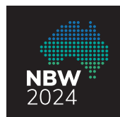
NBW/Year – reversed

The NBW/Year logos are supplied up to 2033. They can be used for social media profile pictures leading up to the week or anywhere a shortened version is required.