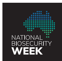
Stacked – reversed